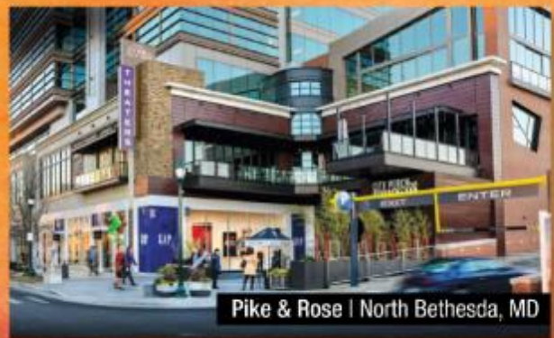
Pike & Rose | North Bethesda, MD

Large scale retail development sees a reprise from the Mid-Atlantic to the Gulf States.