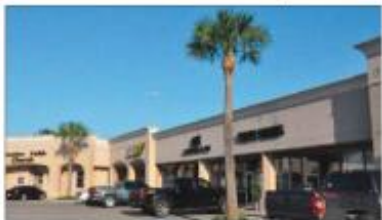
Lakes on Eldridge Centre is located at the corner of North Eldridge Parkway and Tanner Road in Houston.