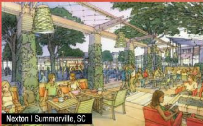
Nexton | Summerville, SC